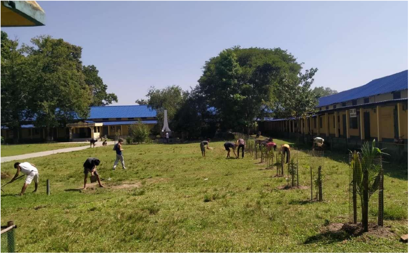
Plantation as a part of clean and green campus initiatives