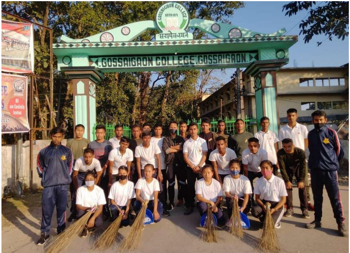
Clean and green campus initiatives