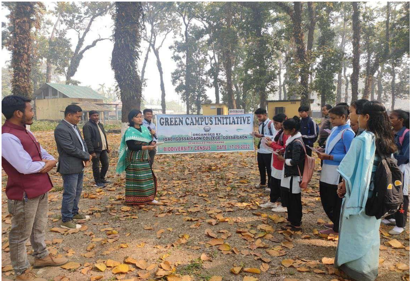
Green Campus Initiatives