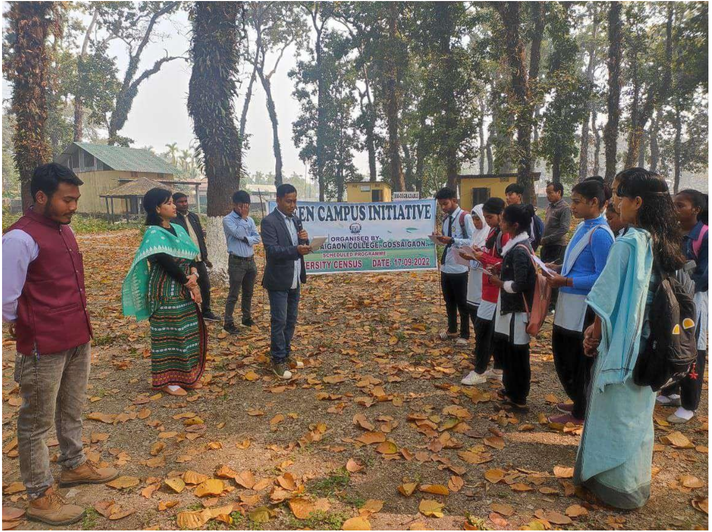
Clean and green campus initiatives