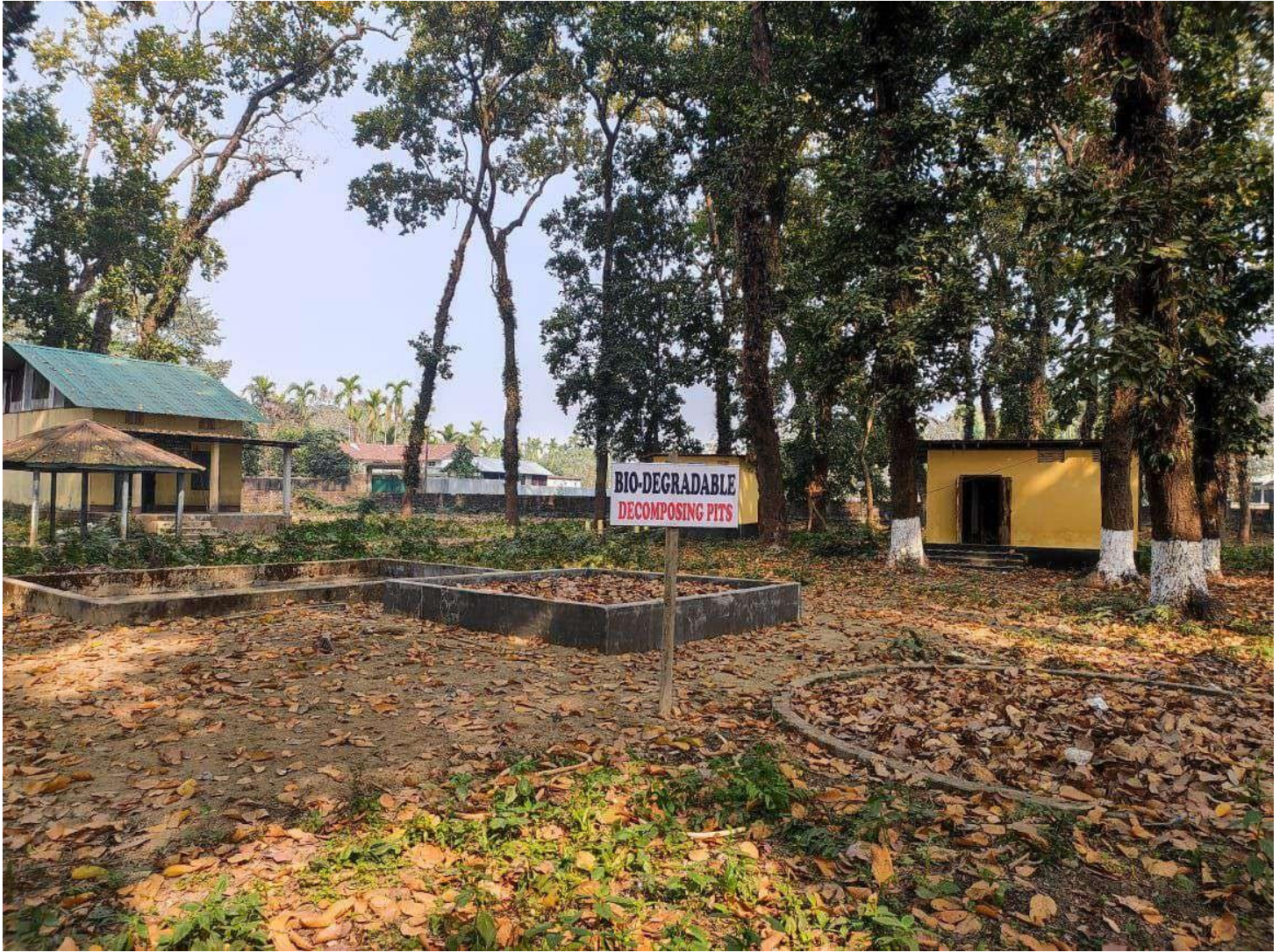
Bio-degradable decomposing pits