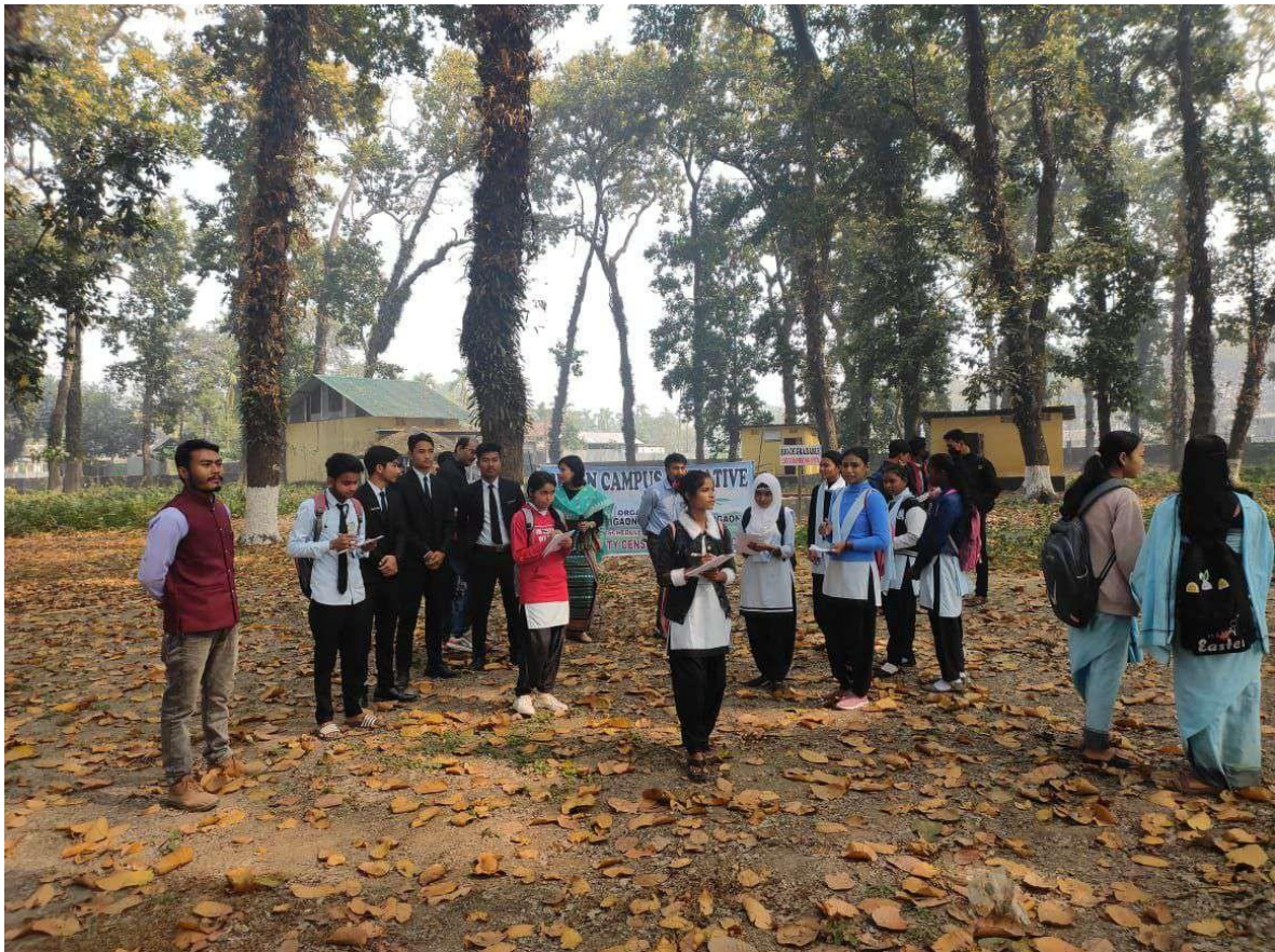
Green Campus Initiatives