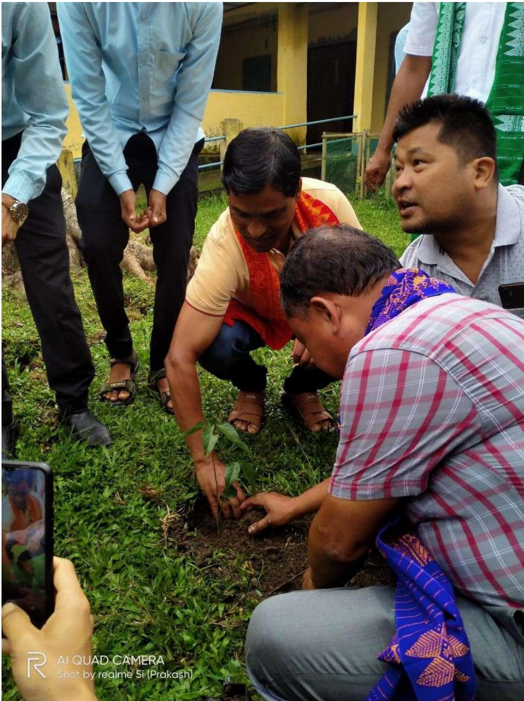
Plantation as a part of green campus initiatives