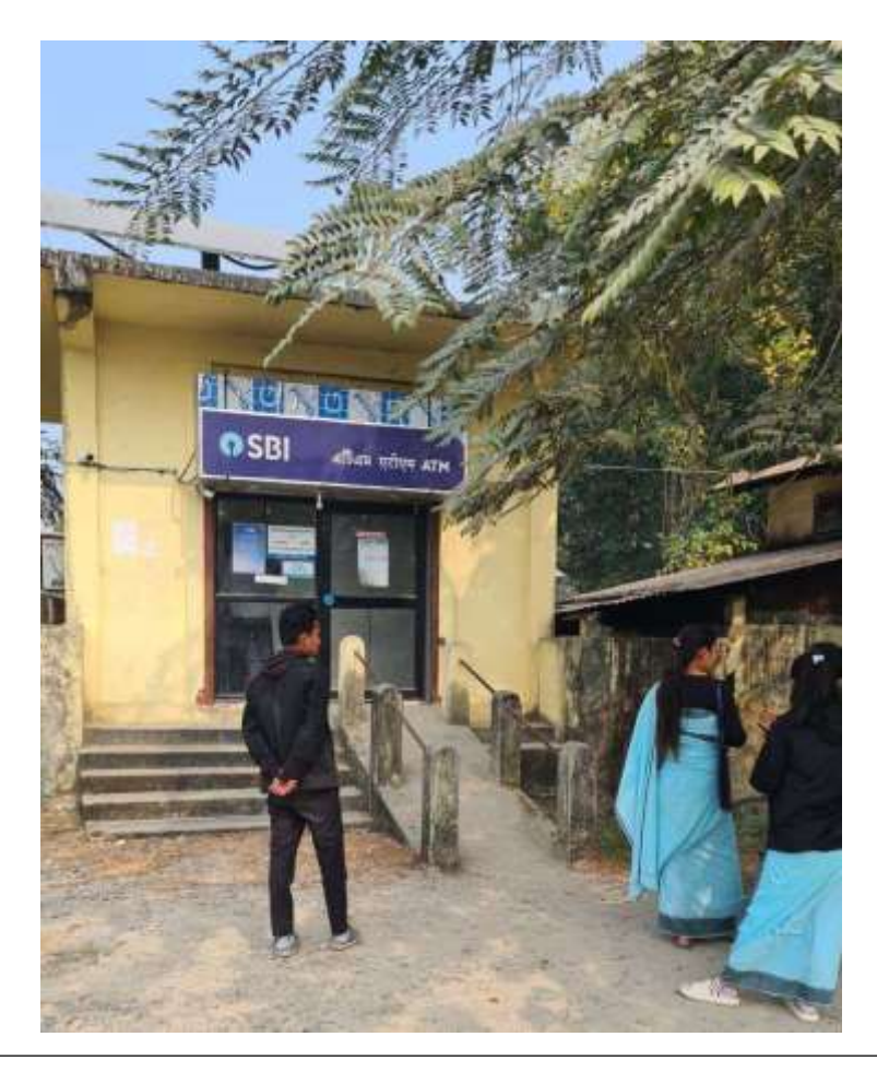
ATM facilities of the College Campus