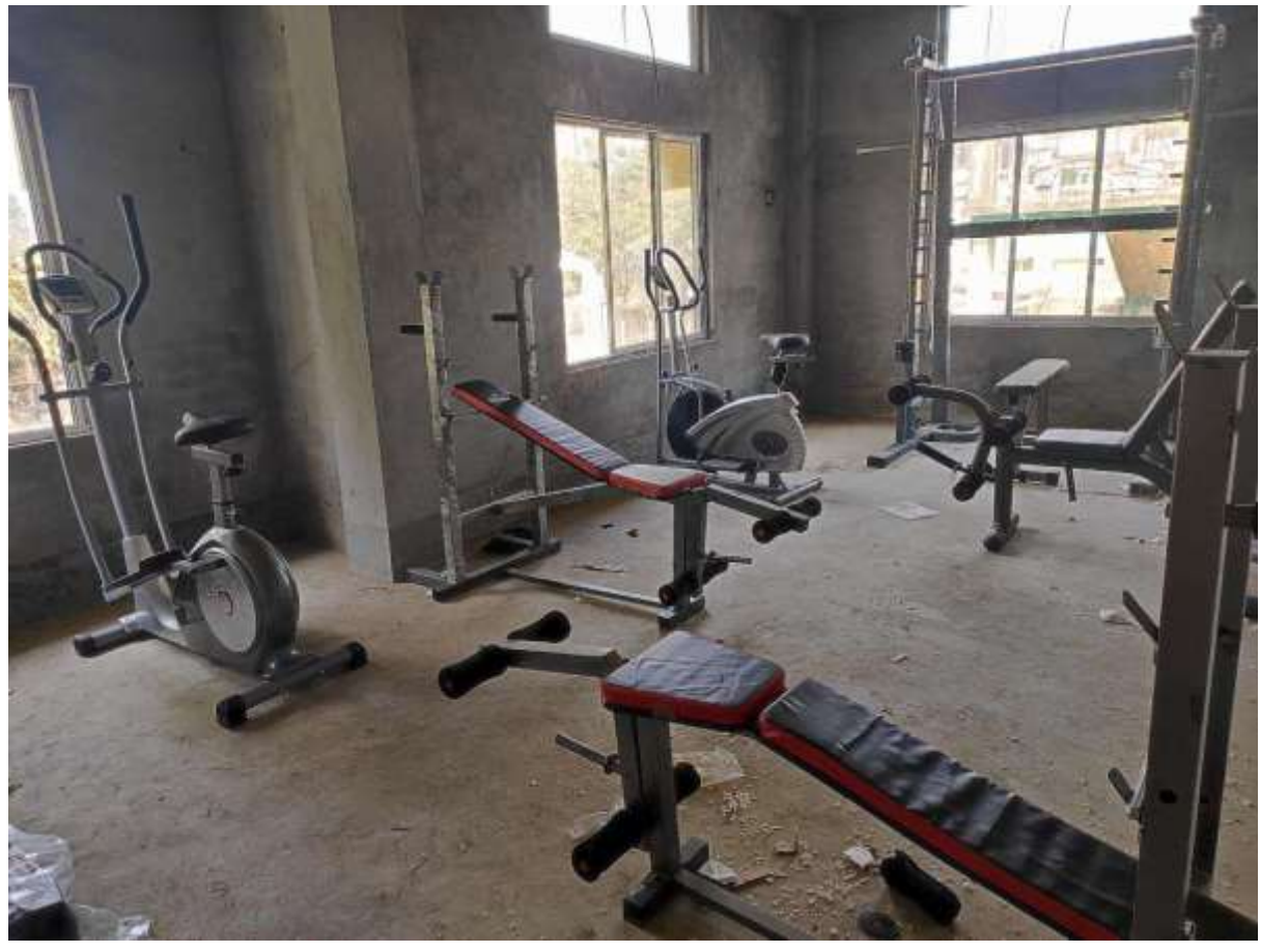
Gym Khana of the College