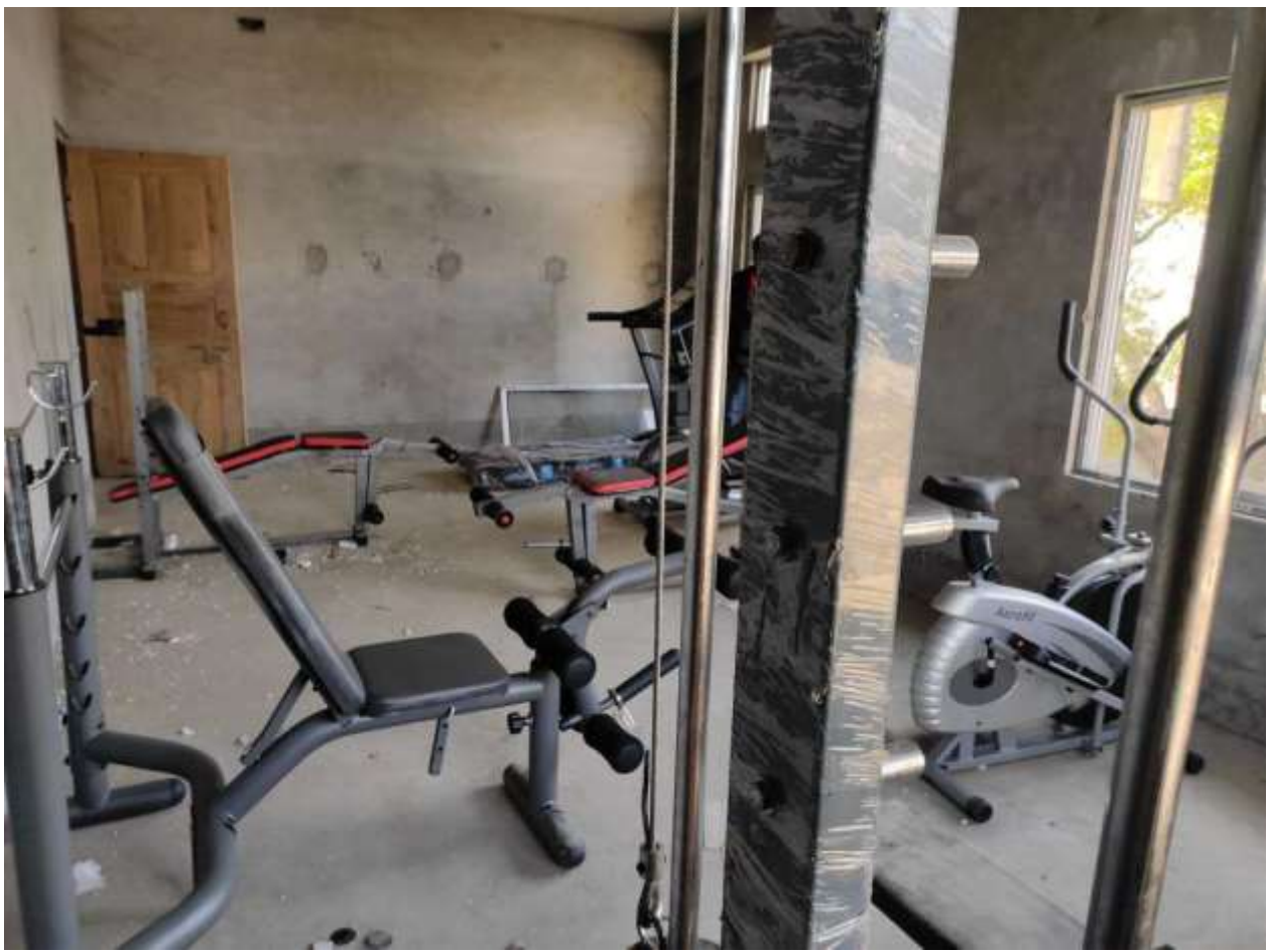
Gym faciliteis of the College