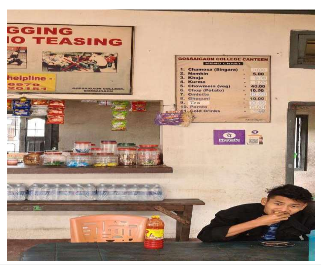
Banner against ragging and teasing displayed in Canteen