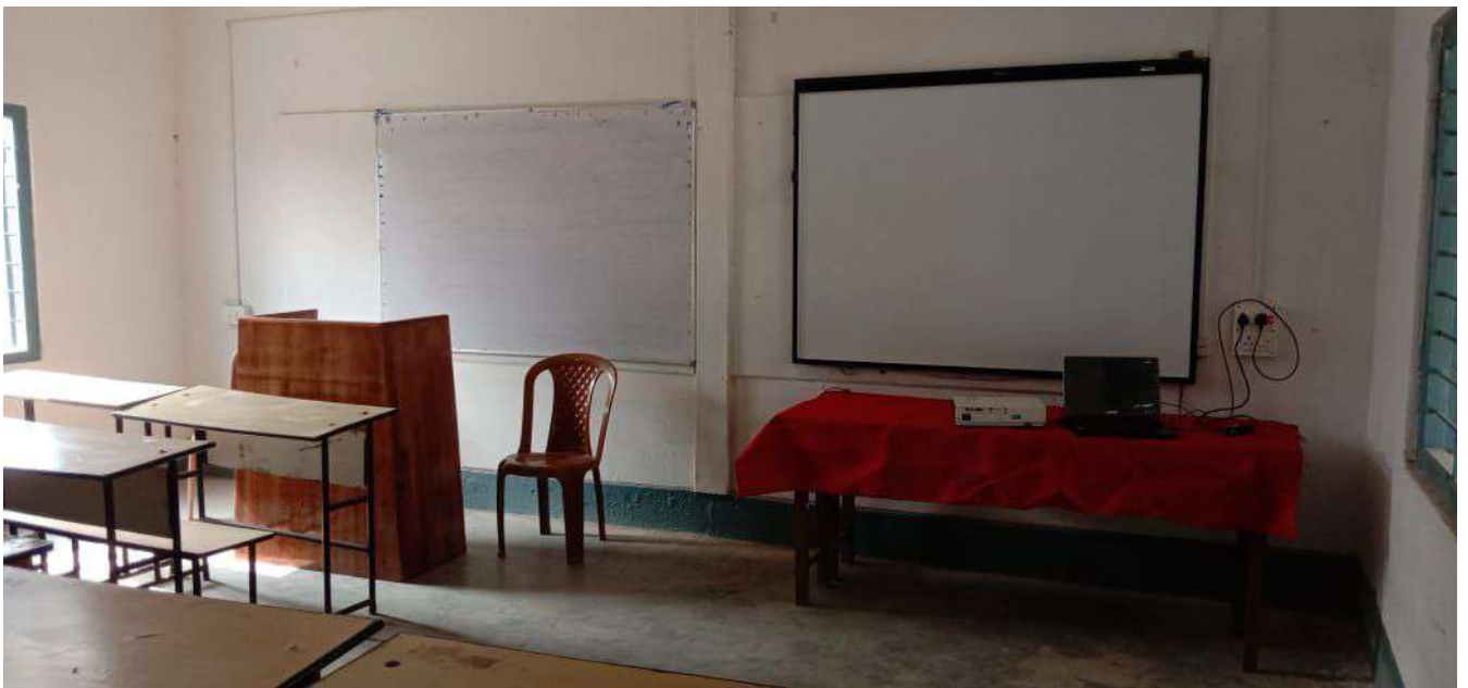
Class room with podium