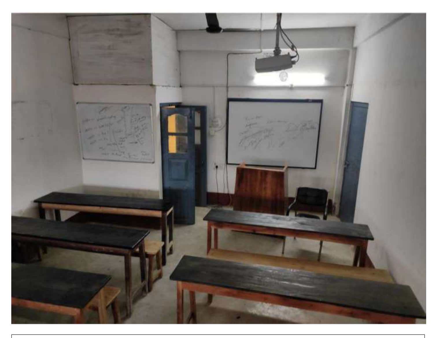
Smart Class Room with Podium