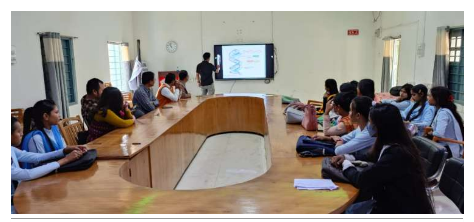
Seminar Hall with Interactive Board