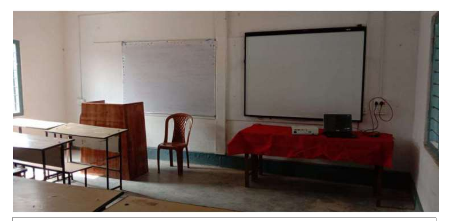
Smart Class Room with Podium