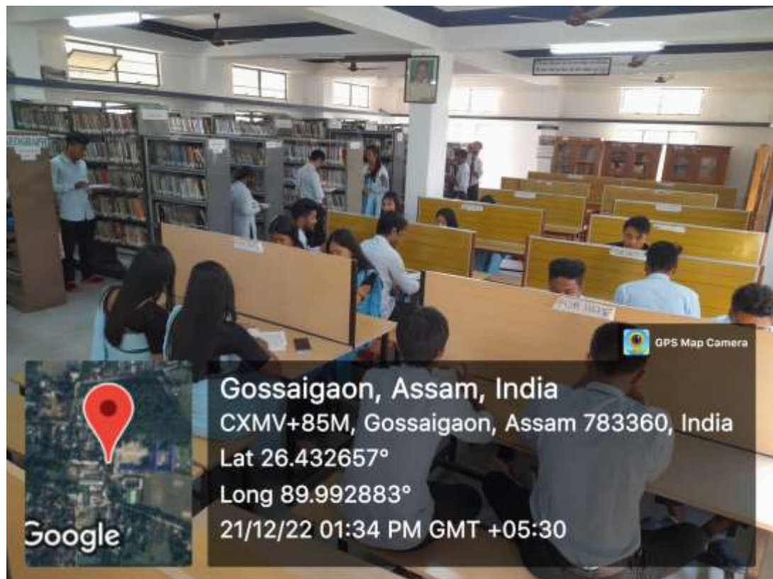
Library facilities of the College