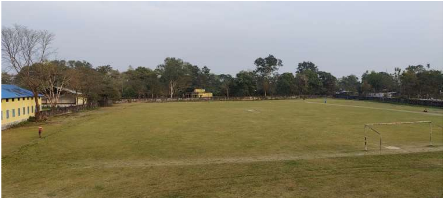
Football Play Ground of the College