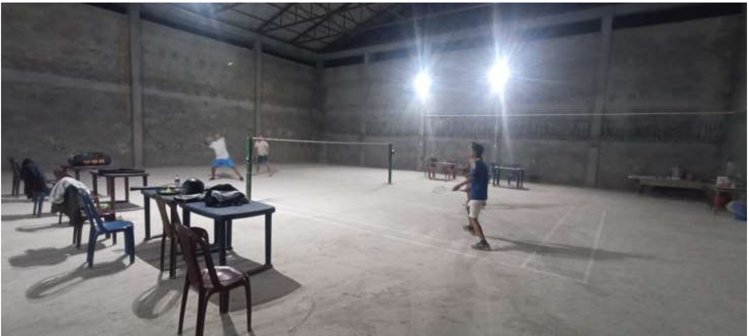
Playing Badminton in the Indoor Stadium