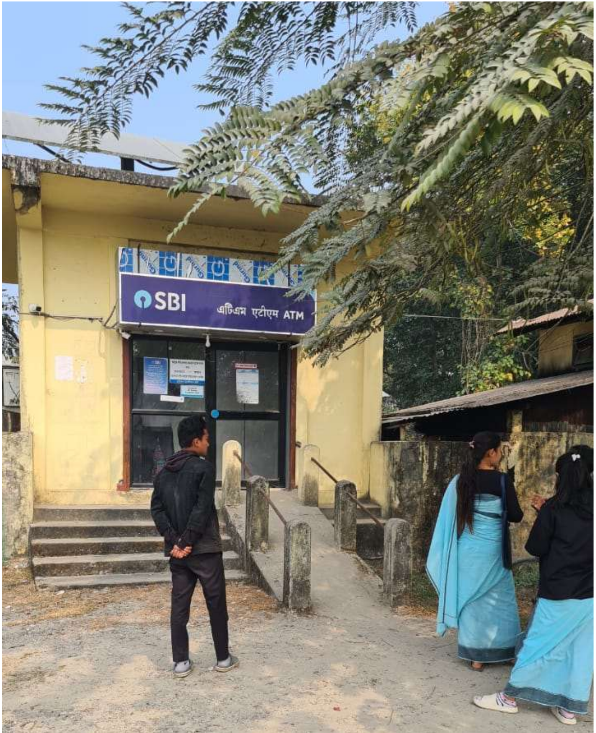
ATM Facility of the College