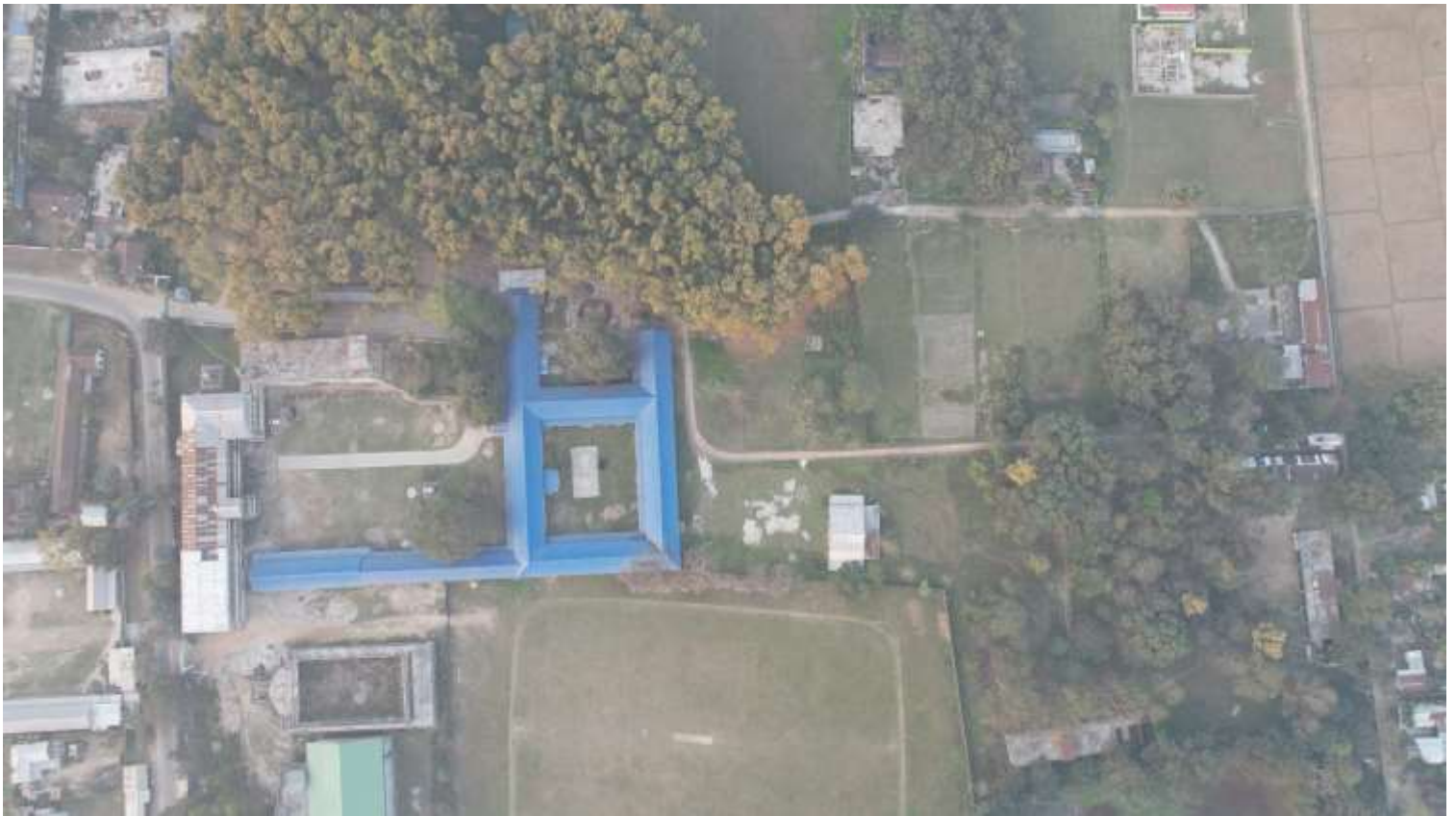
Aerial view of the College Campus showing Football Play Ground