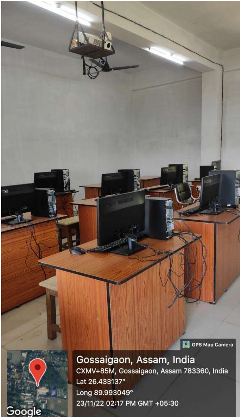
Computer Lab showing projector