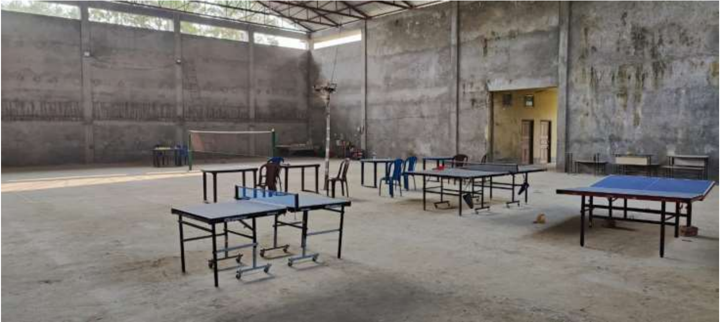
Badminton and Table Tennis Court (Indoor Stadium)