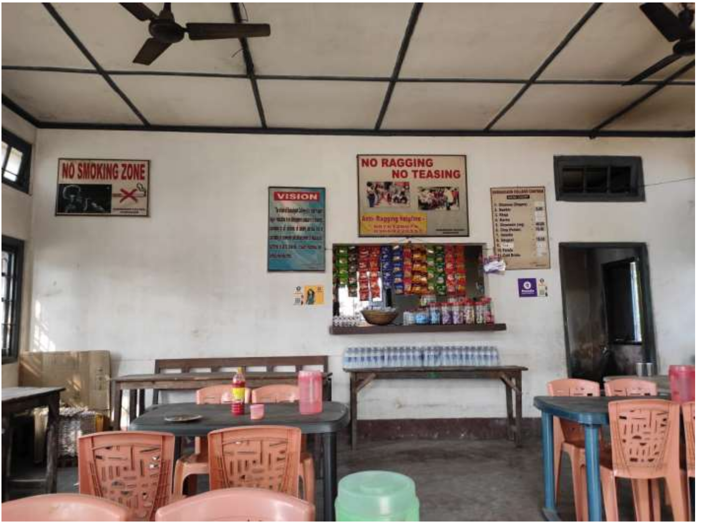
Canteen Facility of the College