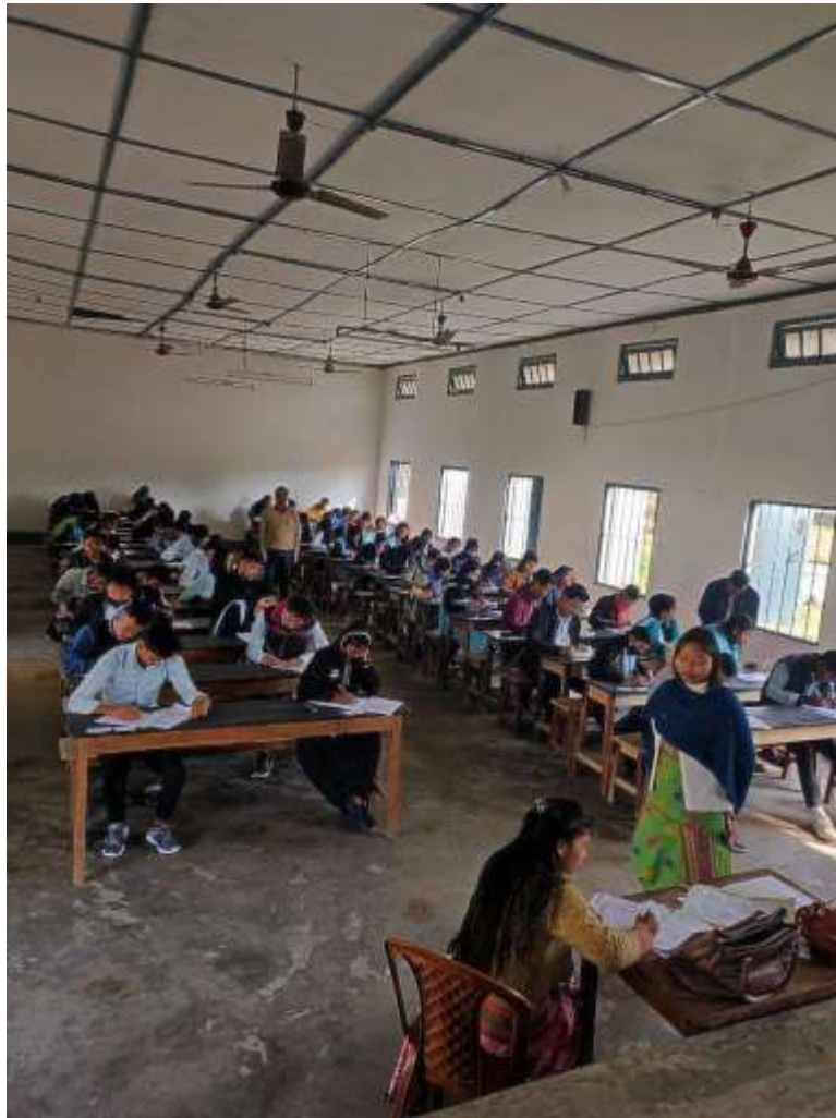
Examination Hall cum Class Room