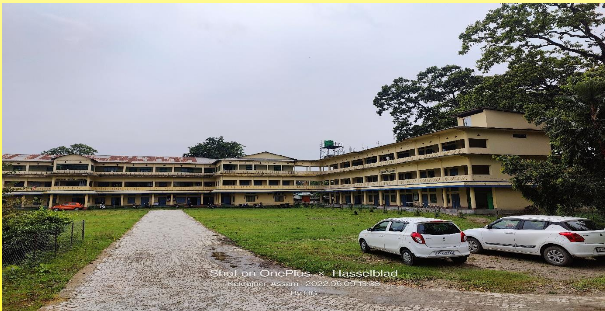
Administrative and Arts Block